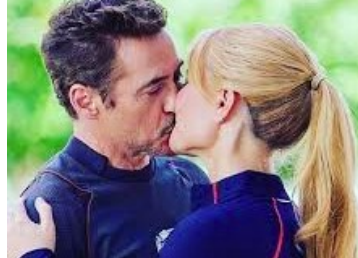
8; Name the actors and the Marvel characters for 4 points