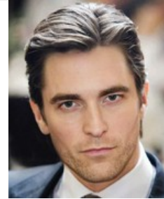
6; Whose faces are morphed together 2 points