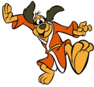
1; Name the superhero and his real identity 2 points