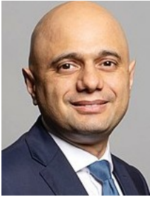
7; Name the politician and his most recent government post?