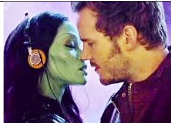
14; Name the actors and the Marvel characters for 4 points