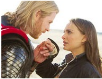
5; Name the actors and the Marvel characters for 4 points