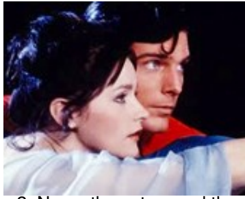
2; Name the actors and the DC Comics characters for 4 points