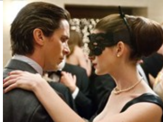
11; Name the actors and the DC Comics characters for 4 points