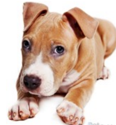
12; Breed of puppy